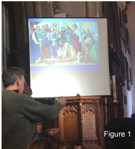
Fig 1 shows our current arrangement. Figs 2, 3 & 4 show the proposed screen in the open and closed position as viewed from the chancel & nave.